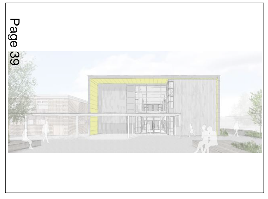
Perspective view from new courtyard of Proposed New Building Entrance